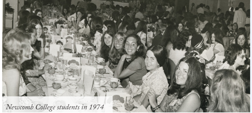
Newcomb College students in 1974